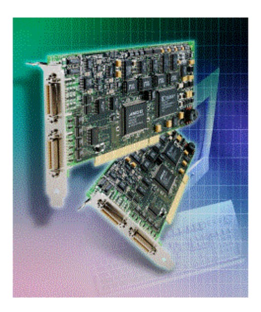
Figure 1. Keithley KPCI-3108 DAQ Card, offering up to 16 channels of analog input, plus other data acquisition functions.